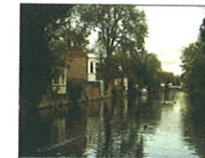
3 The River Lea, Ware