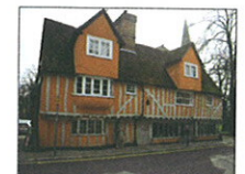
4 Hertford Town Centre