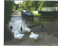
2 The Ford of Braughing