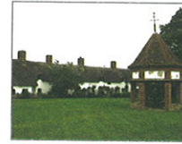
1 Ardeley Village Green

HNJV has, for the last year, been asking local people for their thoughts, concerns and ideas for our landholding to the north of Harlow. We have used this to shape our thoughts on our draft masterplan and to directly inform our forthcoming submissions to East Hertfordshire and Harlow Councils for their Local Development Frameworks. We would now like to share this with you.